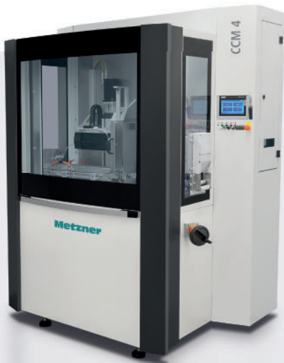
pic.: Metzner CCM 4

Circular knife cutting machines for steel reinforced materials