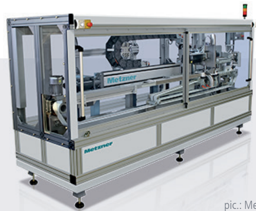
pic.: Metzner CCM 6

All three models are specially designed for cutting steel reinforced profiles and hoses.