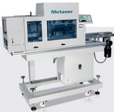
pic.: Metzner CCM 2